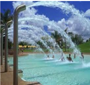
“Prime agricultural hub